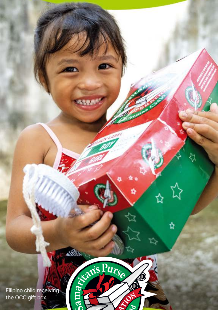
Filipino child receiving the OCC gift box